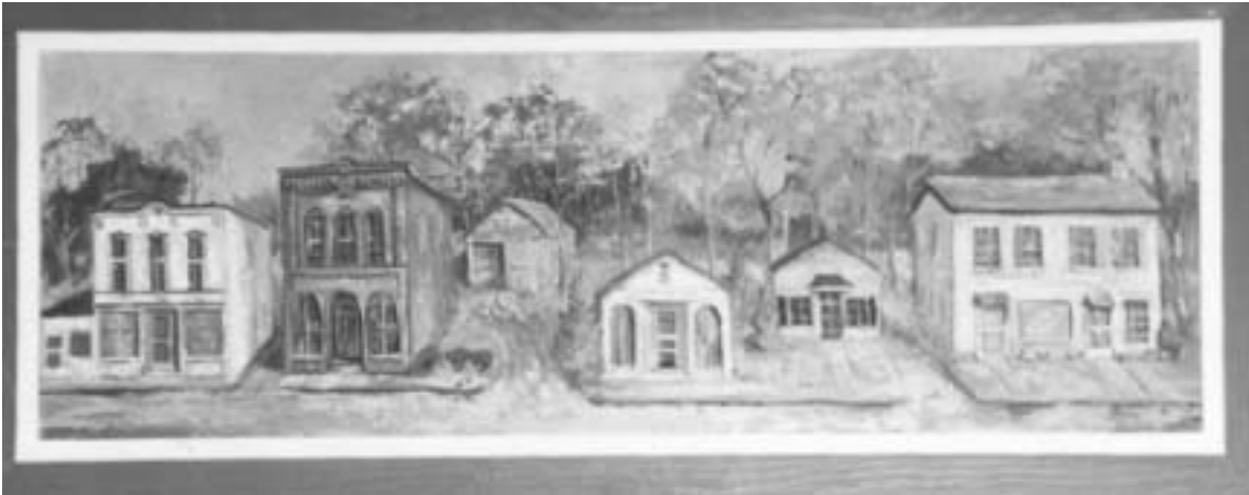
South Main Street